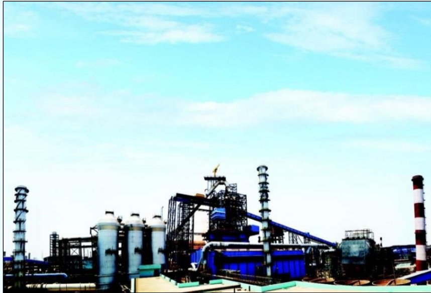
Exhibit 1: Rourkela Steel Plant of SAIL