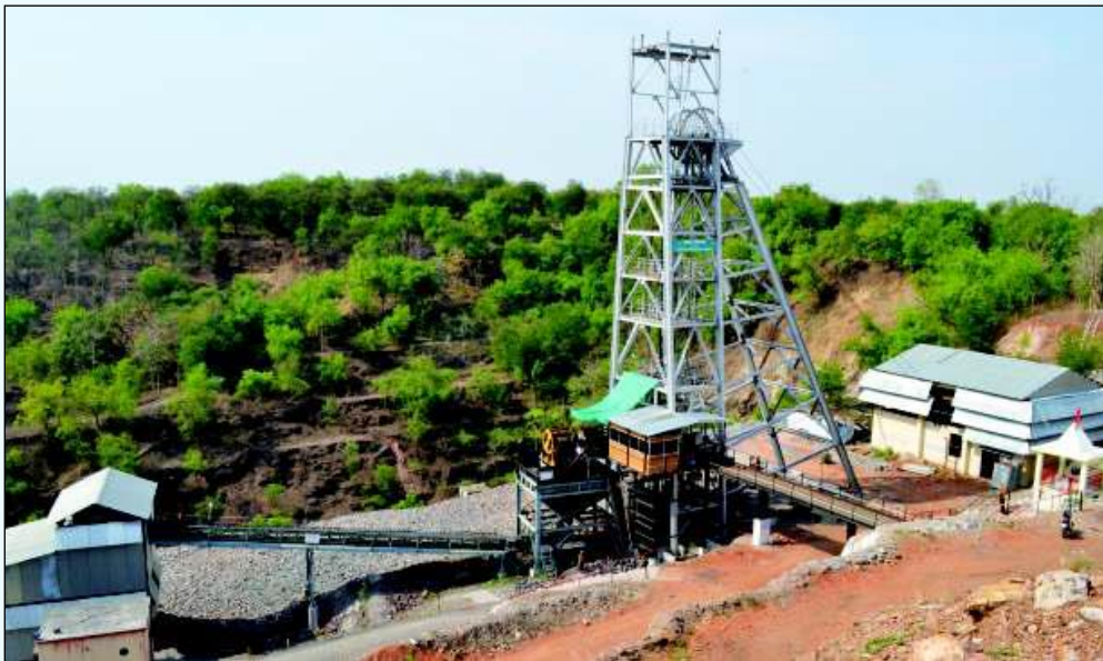
Exhibit 2 : Vertical shaft at Gumgaon Mine of MOIL

MOIL Ltd., earlier known as Manganese Ore (India) Limited, is a Miniratna Category I CPSE under the Ministry of Steel established in 1962. It is the largest producer of Manganese ore in India.